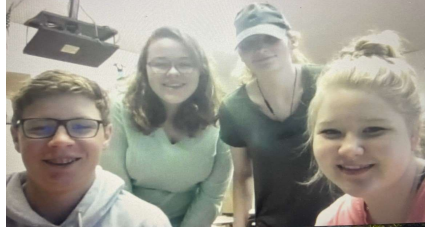
North Gem B